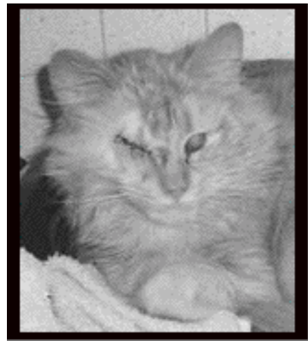
Justine needed action, not excuses.

Reality: Type this little gem into Google and you'll get 41 hits. That's 41 shelter directors making excuses for their own failures to get the job done. The fact of the matter is, shelters that save only 1/3 of the animals coming in are the exception today rather than the rule. And promoting this type of negative, depressing view of the shelter is more likely to keep people from coming to you for a pet than it is to guilt them into supporting you.